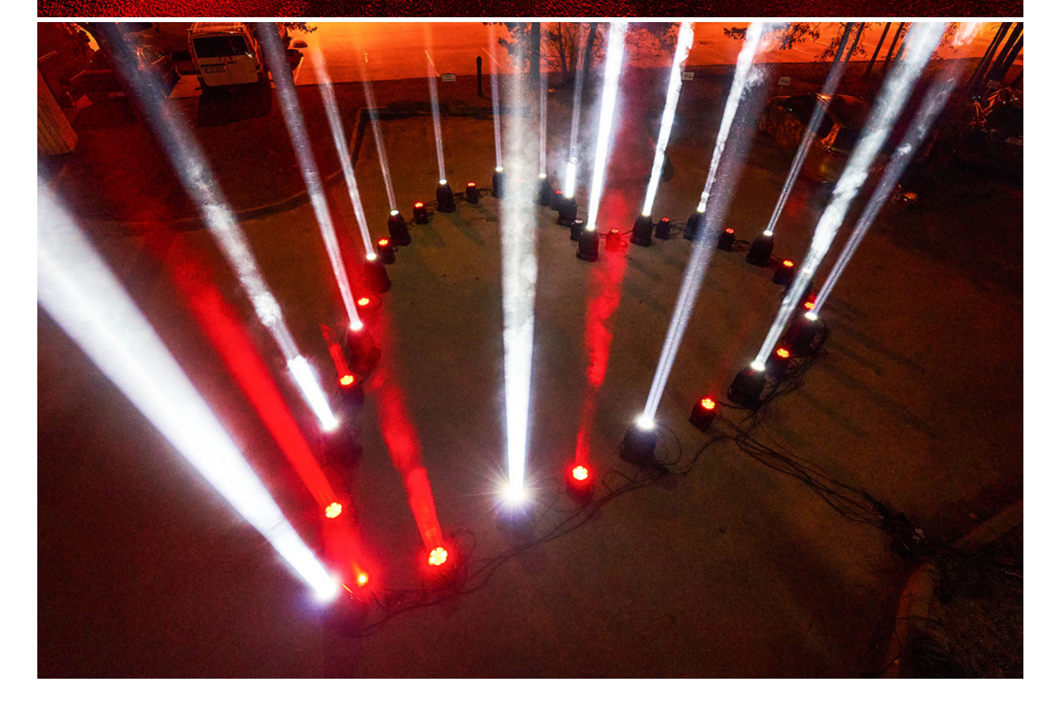
Strikken Helps deliver Covid-19 Tests And Lights the Sky in Estonia