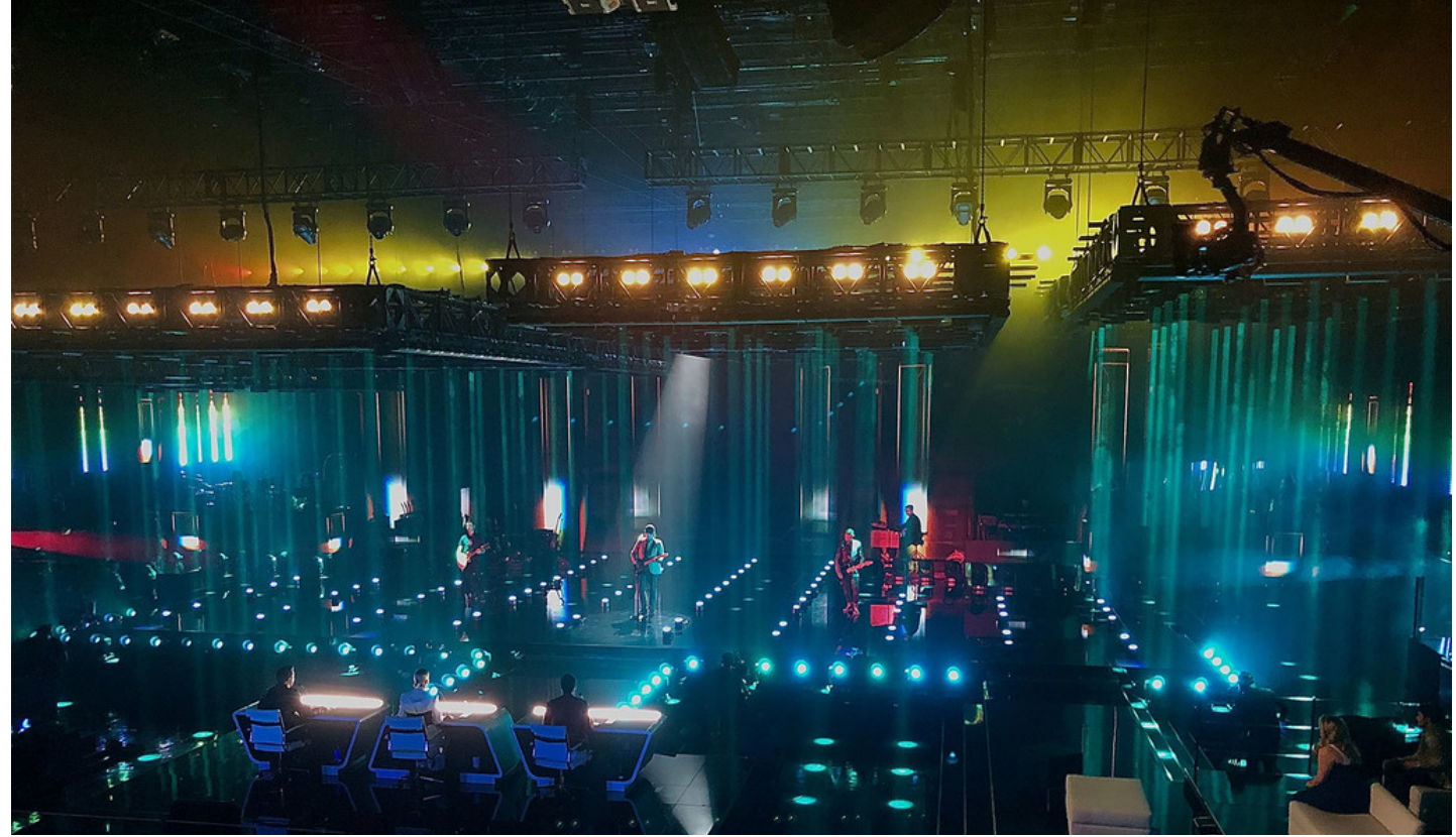
Robe MegaPointes for American Idol