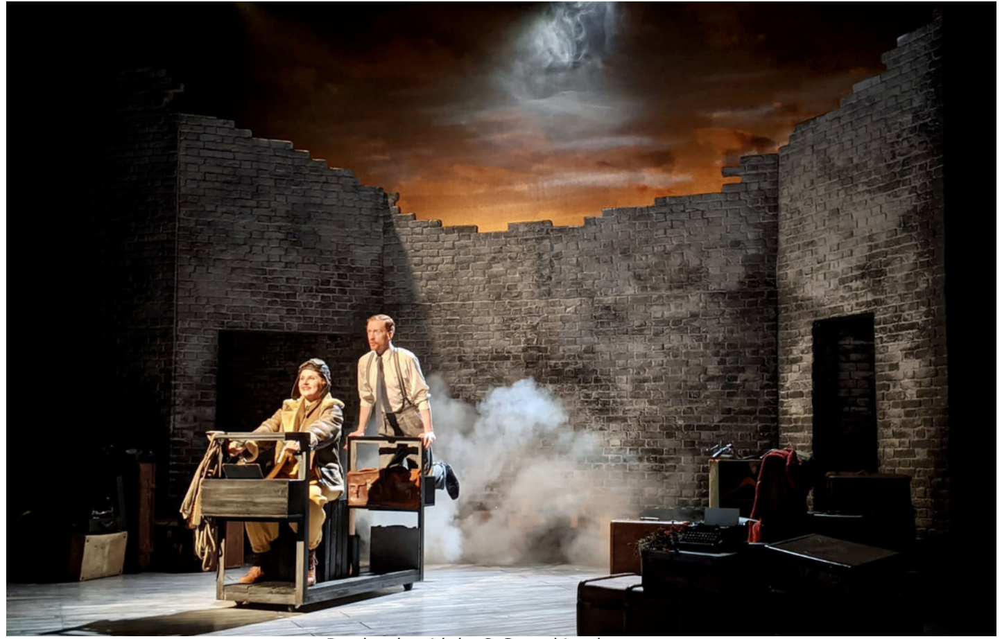
Production Light & Sound Looks Forward with RoboSpots