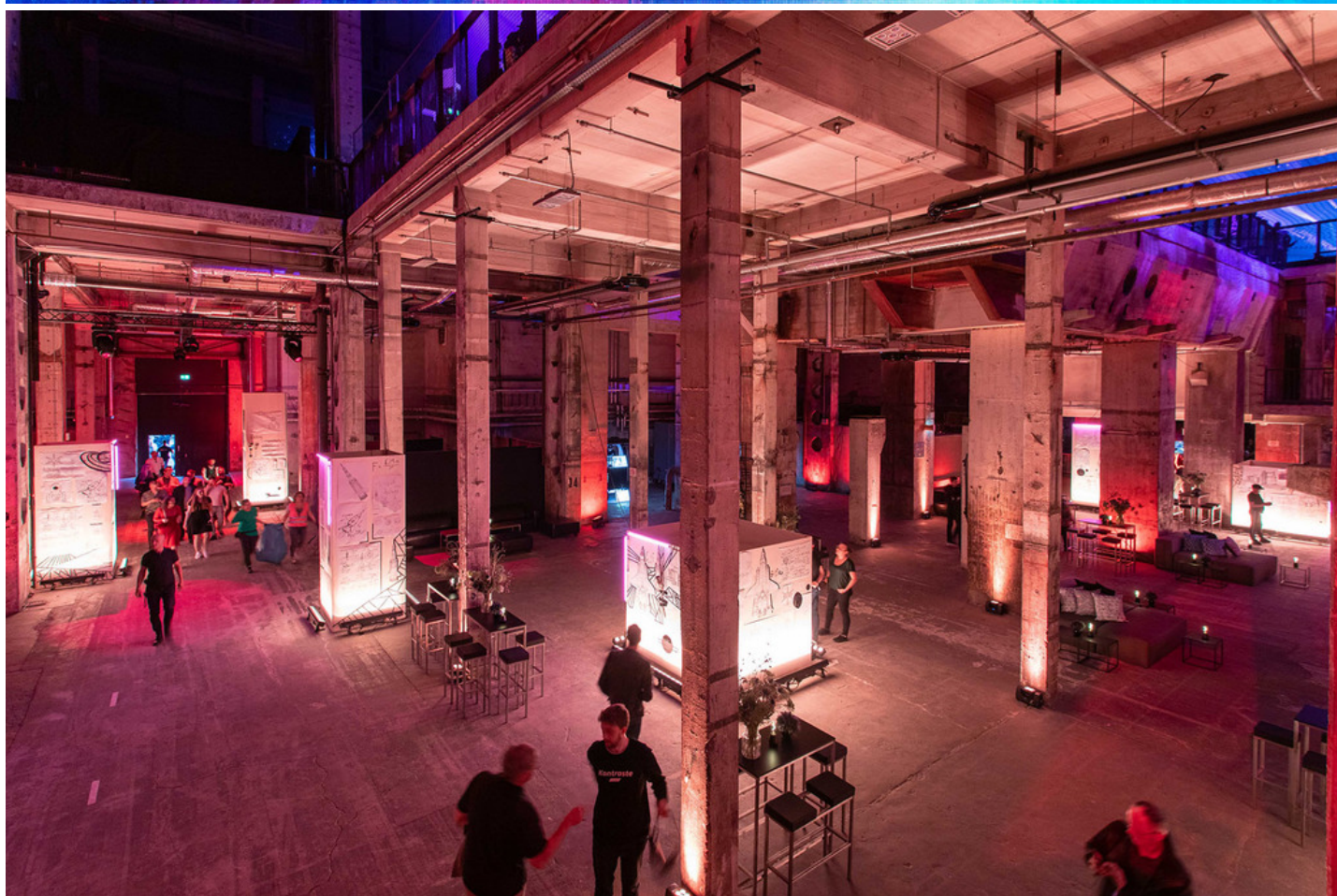
Robe Helps Hack the Galaxy and Embraces the Moment in Berlin